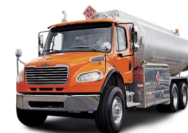
Freightliner M2 106