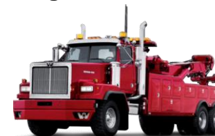
Western Star 6900