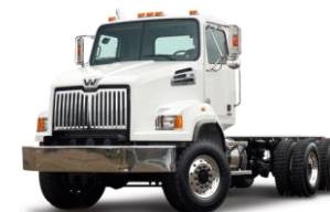
Western Star 4700