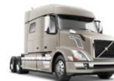
Volvo VNL 730