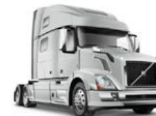
Volvo VNL 780