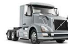
Volvo VNL 300