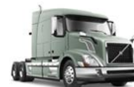
Volvo VNL 630