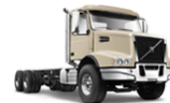
Volvo VHD 200