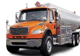
Freightliner M2 106