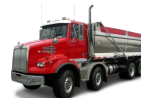
Western Star 4900