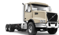
Volvo VHD 200