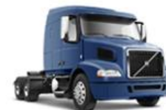
Volvo VNM 630