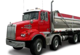
Western Star 4900