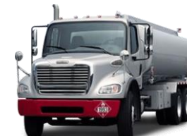
Freightliner M2 112