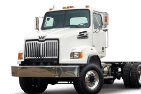
Western Star 4700