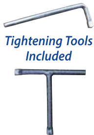
Tightening Tools Included

From the ice roads of Canada to the Rocky Mountains, in the woods or on the logging roads, in the most demanding traction control situations possible, X-Treme Grip™ Tire Chains provide strength, durability and stability that protects your investment in drivers, equipment and tires.